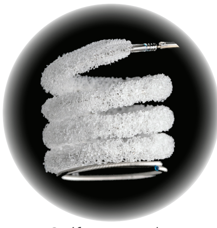
Self-expands on contact with blood

Porous embolic scaffold supports rapid formation of small interconnected clots