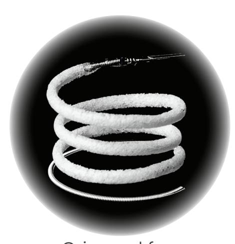
Crimped for catheter delivery